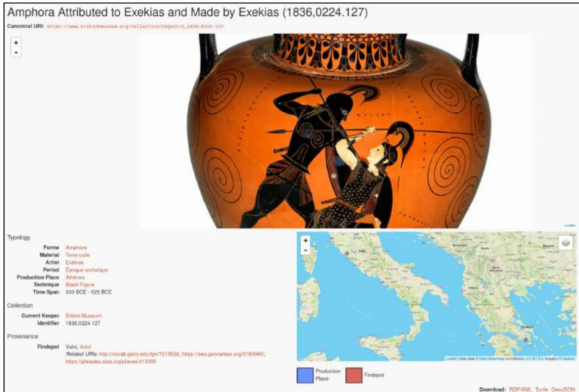
Figure 3: British Museum 1836,0224.127, a black-figure amphora of Exekias, as represented partially translated in French in the Kerameikos.org viewer:

Kerameikos.org to be displayed in a distinct interface that includes typological or physical metadata (interlinked with Kerameikos.org URIs), but also displays static and zoomable IIIF images and a dynamically generated map that includes a point for the production place and findspot, when applicable. Although translations of this interface have not yet been fully completed, the UI is multilingual, drawing preferred labels in other languages directly from Kerameikos.org LOD when requested by the user (see Figure 3 ).