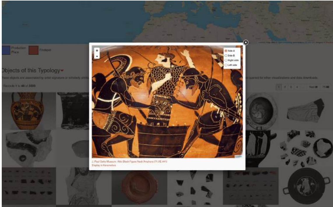
Figure 1: J. Paul Getty Museum 71.AE.441 as displayed in a IIIF viewer with four associated photographs.

Many of the findspots of these objects (when available), particularly from the J. Paul Getty Museum and British Museum, have been normalized to geographic identifiers from Wikidata.org . This facilitates the visualization of geographic distribution of the concepts associated with these vases, for example, artists or shapes (see Figure 2 ).